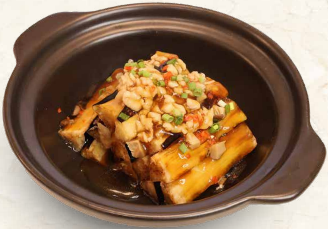
Braised Eggplant with Plant-based Meat in Spicy Sauce