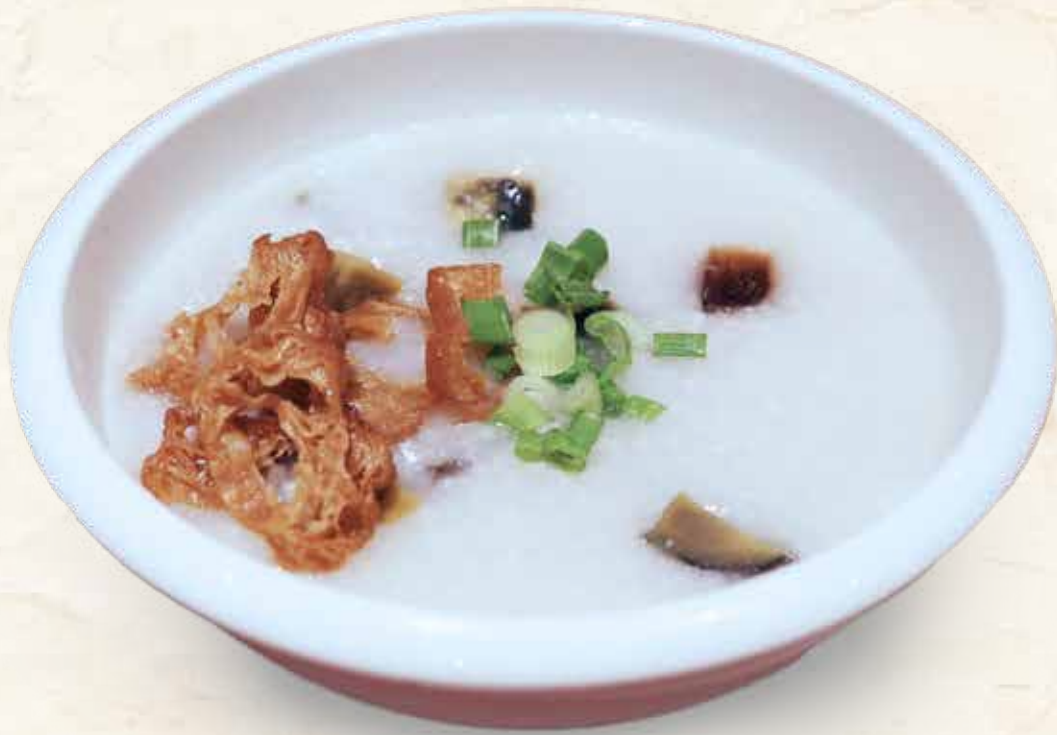
Century Egg and Minced Pork Congee