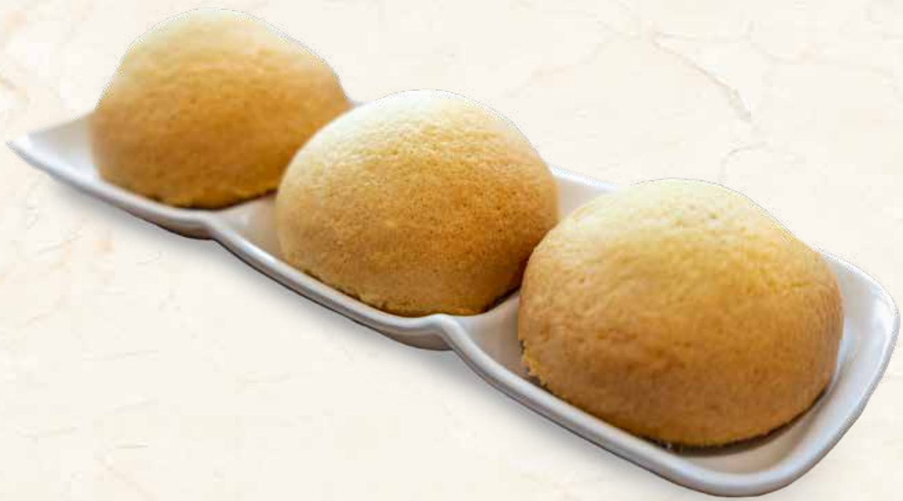
Baked Barbecue Pork Buns