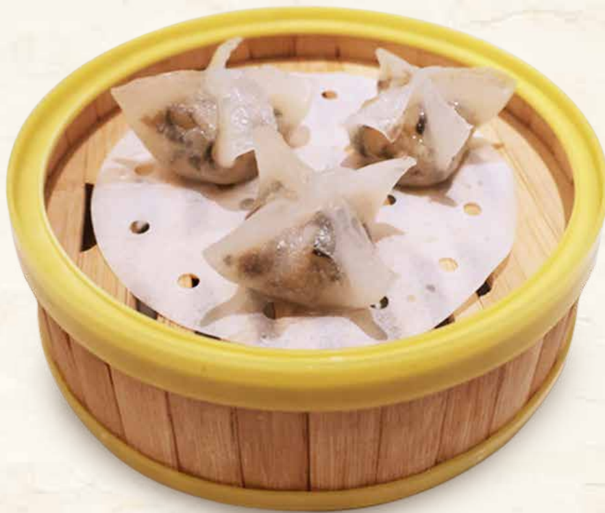
Vegetarian Truffle Dumplings