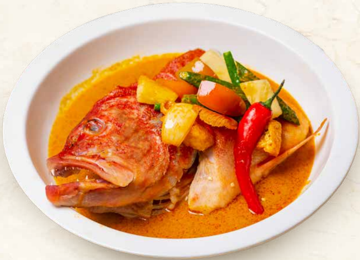
Curry Fish Head