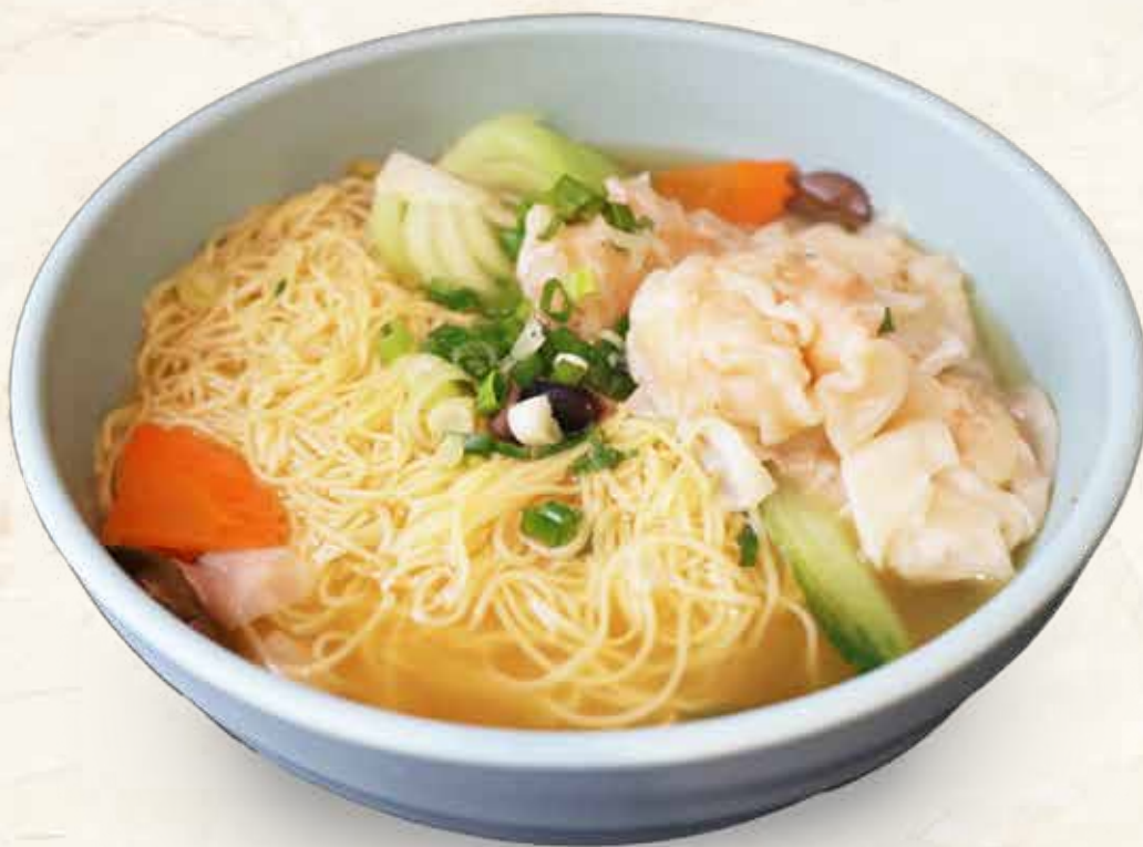
Egg Noodles Soup with Shrimp Wanton