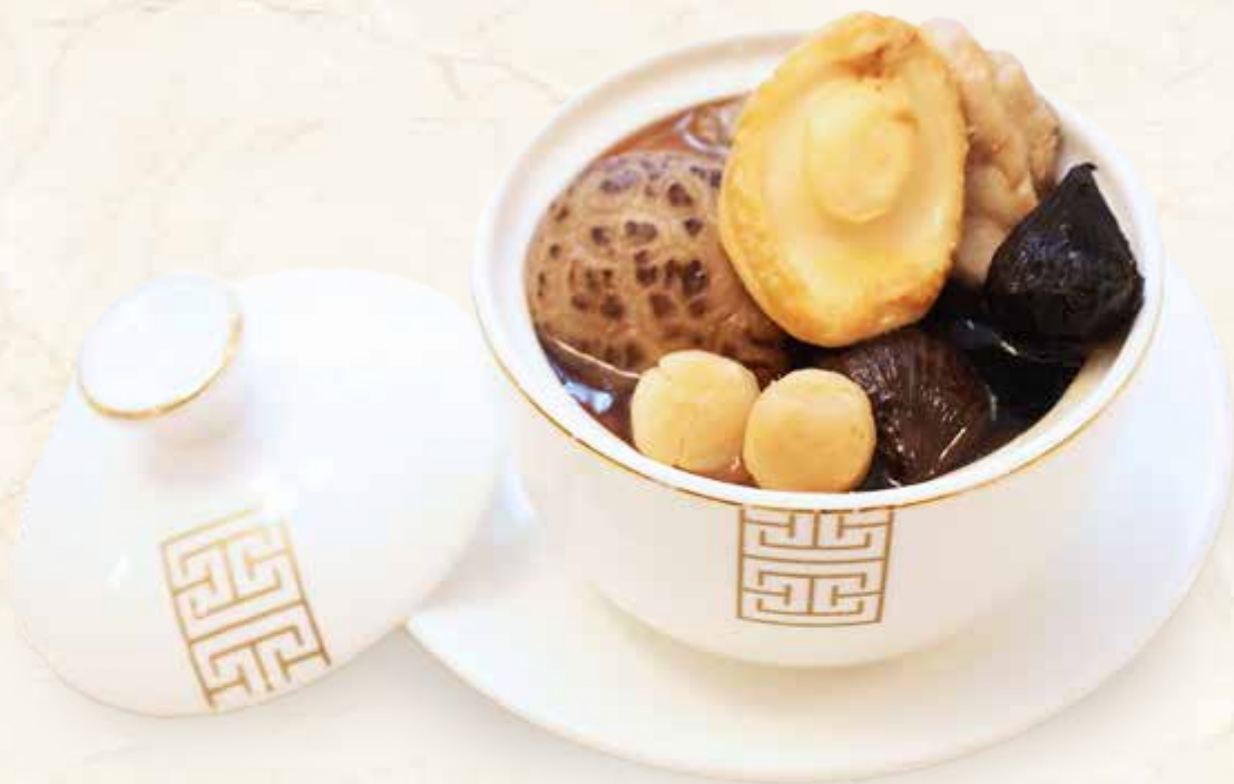
Double-boiled Chicken Soup with Abalone, Flower Shiitake Mushrooms, Dried Scallops and Black Garlic