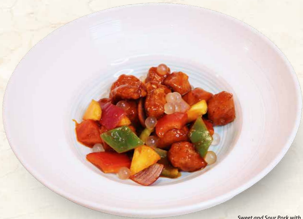
Sweet and Sour Pork with Lychee Balls