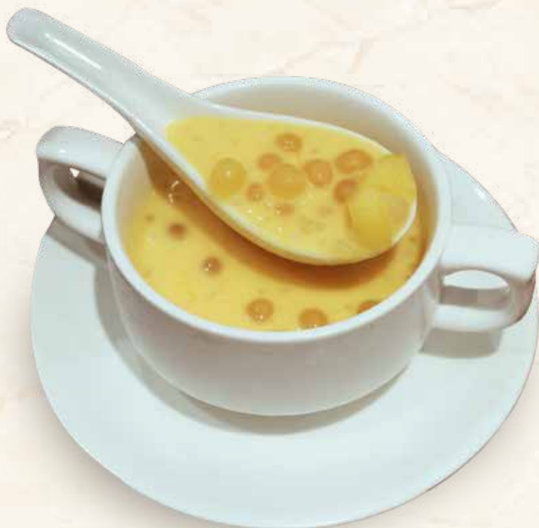
Mango Pomelo Sago